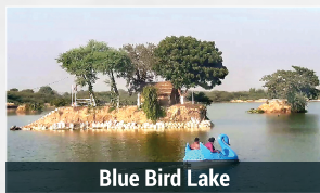
Blue Bird Lake