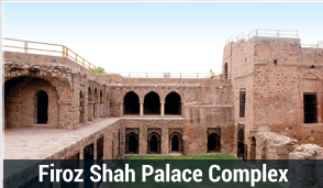
Firoz Shah Palace Complex